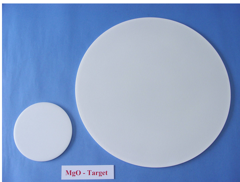
Comparison of mass product size(left) and developed large size(right)

By reviewing both manufacturing process which had accumulated technology over the years, the sintering material size was reached to the world's largest class 18inch / 460mm with keeping the same purity and the same density this time. The present available amounts of supplies are 120 units per year.